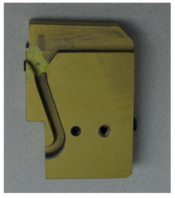
Curling Die after Repair